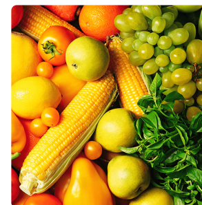
Ready Steady Grow